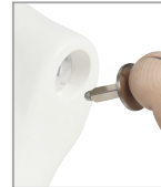
push and pull